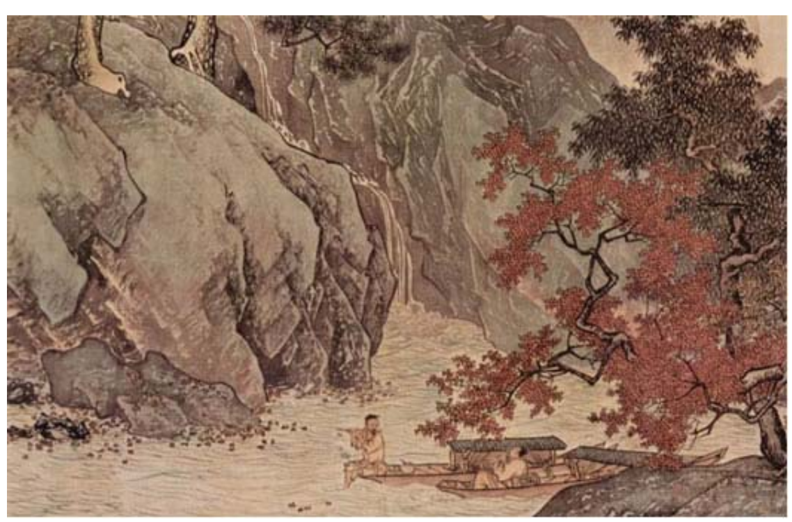
Fishermen in Fall, by Tang Yin, 1523 AD.

In January 2009, a puzzle formed in my mind after I visited the Chinese painting gallery inside the Hong Kong Culture Museum. The gallery displayed the representative paintings of the School of Lingnam , which are said to be highly modernized. Frankly, I was bored by the narrow motifs that did not go beyond landscape and flowers. Despite the fact that those painters had lived through the turmoil of Chinese history and the transition from traditional society to modern society, it seemed that the art and reality were disconnected. After reviewing Chinese art history, I found a deep cultural root that might explain this phenomenon. It is impossible for me to cover all periods of Chinese art history in this short essay. Nonetheless, if you believe in statistics, a cross-section sampled from the Ming Dynasty could provide us with an accurate projection of the full picture.