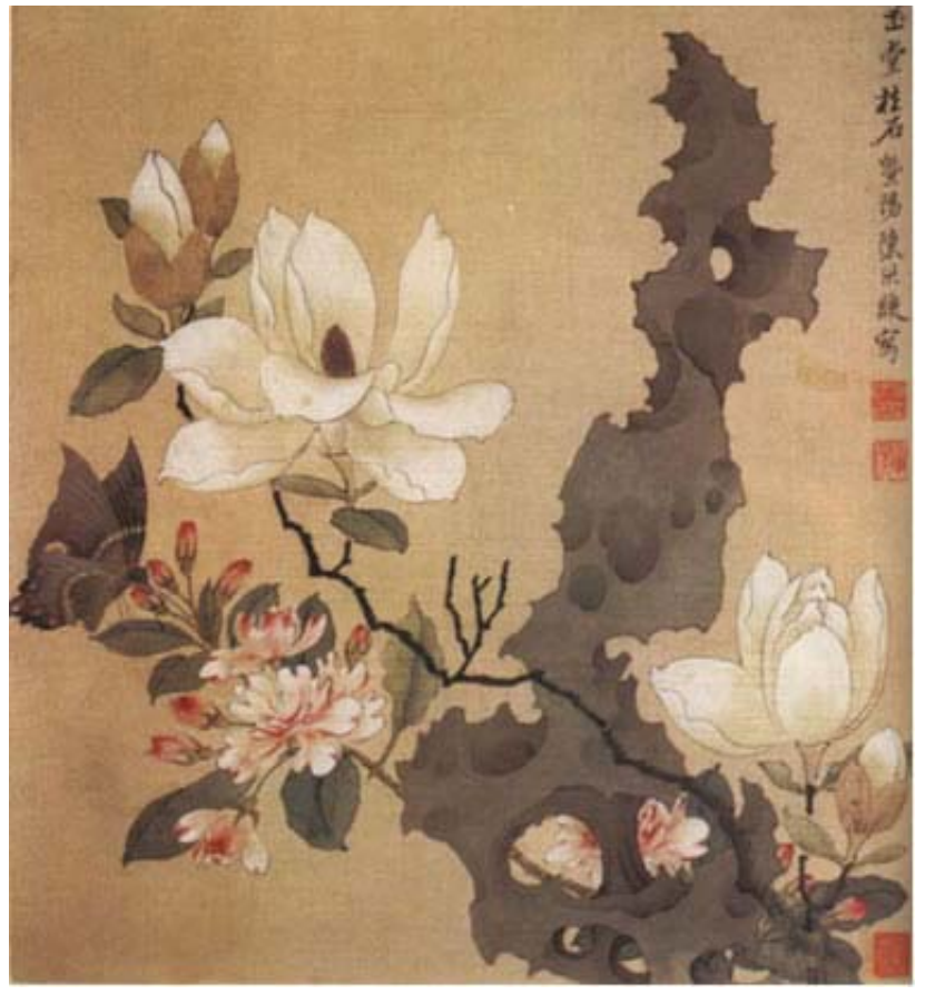
Leaf album painting of flowers by Chen Hong-shou (1598–1652).

Facing brutality, unreasonable punishment, and absurd misinterpretation of art, the escapist mentality of Taoism occupied painters' minds. However, the so-called "escape" happened in the mental space only, and those painters did not physically escape until they encountered a life-threatening situation. They would rather take the risk of being killed by the enraged emperor than giving up the position in the court.